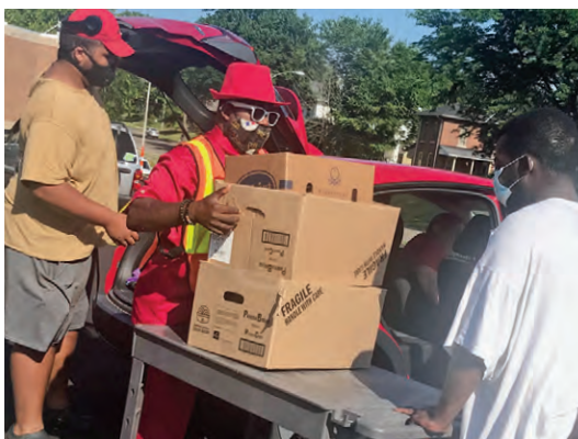
Volunteers work fast and furious during the Grace Episcopal Church Food Pantry distribution. The church always needs volunteers and donations. The food pantry received a grant from the Foundation's COVID-19 Rapid Response effort.