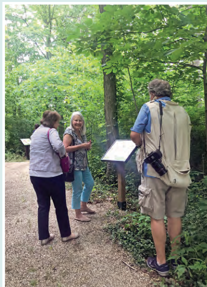
The Storybook Trail is now open at Kingwood. Located near the Peacock Playhouse, the literacy adventure can be enjoyed by all ages. The project partners were the Mansfield-Richland County Public Library, the Keyser Library Fund and the George and Barbara Keyser Donor Advised Fund through the Foundation, and Park National Bank.