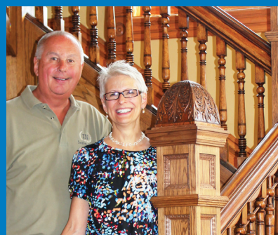
Family members reminisce about playing at the William Ritter House